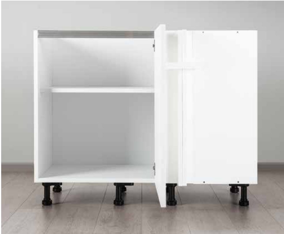
Base angolo Corner base unit