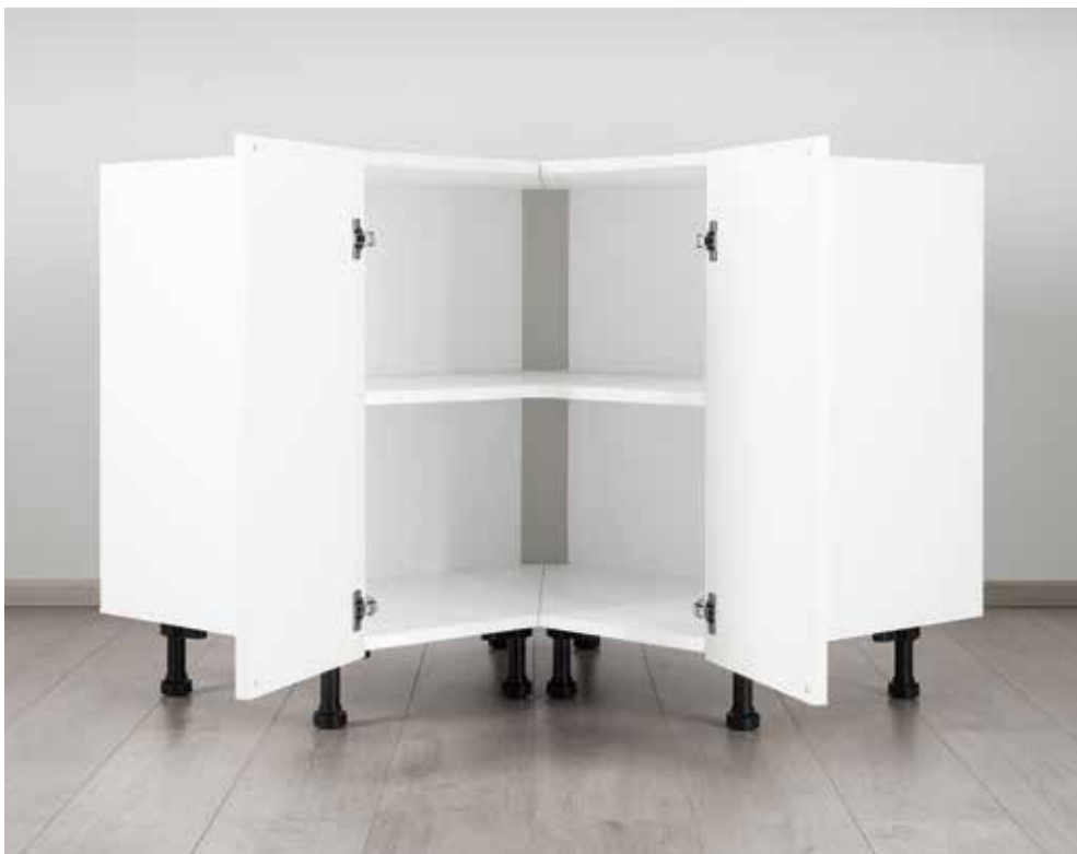
Base angolo a "L" "L" shaped corner base unit